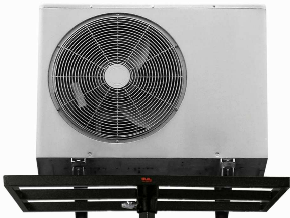
BC-02/M Loading platform 80 x 40 cm (NOT INCLUDED)